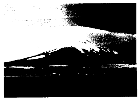
Amazing Cloud Formation

She got up unplugged the TV, and threw out my wine.